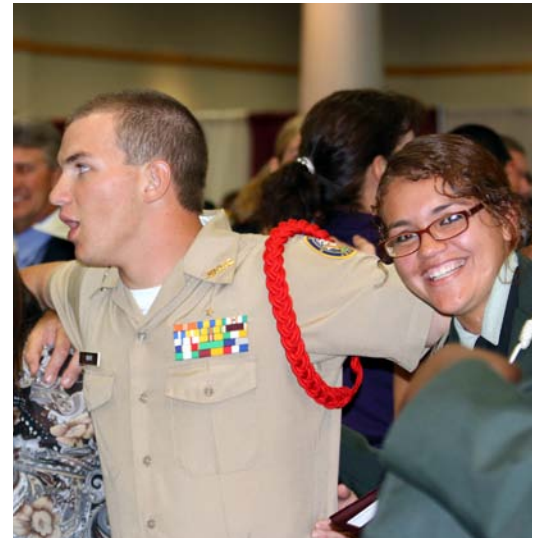
Left: JROTC cadets have dinner with members of the Corps at the Aggie Banquet. Middle and Right: The Aggie Band provided the music to the Aggie War Hymn while attendees "sawed varsity's horns off."